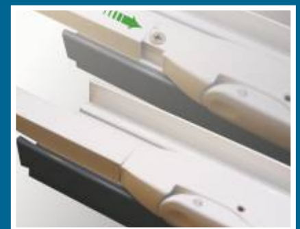
Concealed Handle Fixings