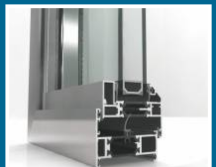
Suitable For Commercial And Domestic Applications