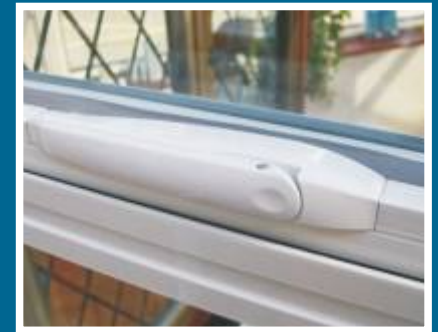
Upgrade to Chelton® Handles